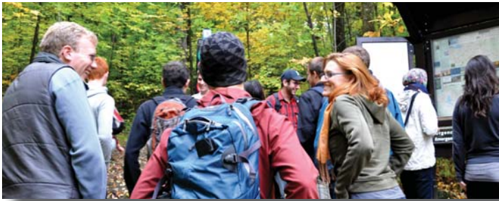
New students and alumni took to the woods to enjoy the beauty of fall in Gatineau Park.

It has also been a very active start to the semester, thanks to the enthusiasm of our new class. Ultimate frisbee and bocce games on the Parliament lawn, the opera, hiking in Gatineau Park, a trip to Kingston and volunteering with the Ottawa Mission are just a few of the events that rounded out the students' calendar during their first month here.