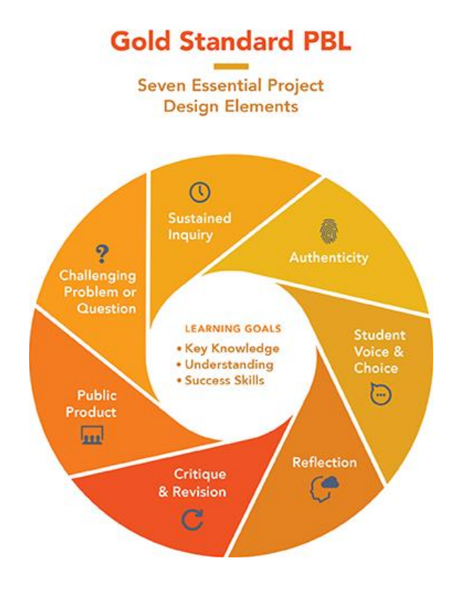
Figure 2 Gold Standard PBL: Seven Essential Project Design Elements<sup>1</sup>

Project Based Learning (PBL) is an instructional approach that "encourages both students and teachers to dig deeply into a subject, going beyond rote learning and grappling with the concepts and understandings fundamental to the subject and discipline" (Larmer et al., 2015, p. 35). With student learning goals in mind, educators create project that include the seven essential project design elements (illustrated in Figure 2): (1) a challenging problem or question, (2) sustained inquiry, (3) authenticity, (4) student voice and choice, (5) reflection, (6) critique and revision, and (7) a public product (Larmer et al., 2015).