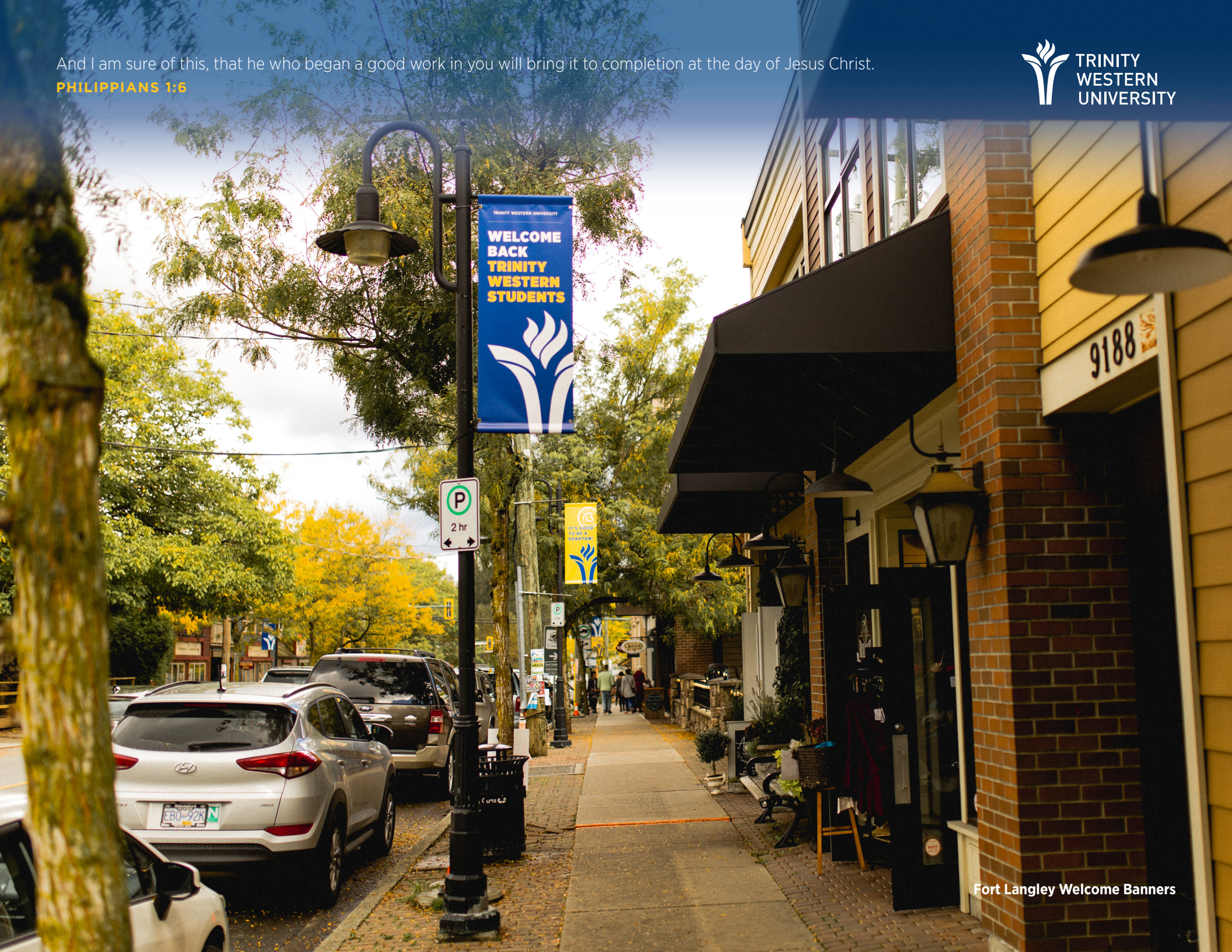
Fort Langley Welcome Banners