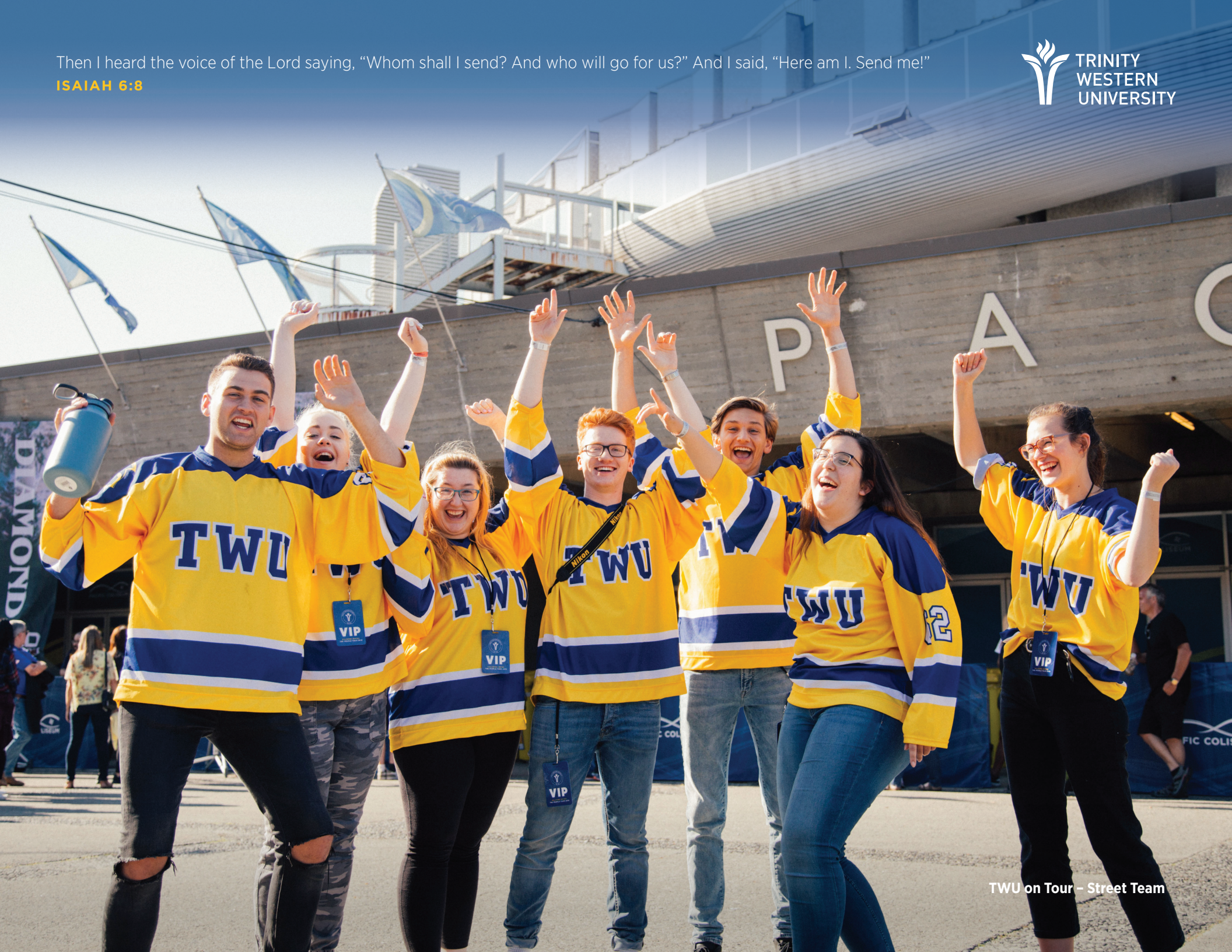
TWU on Tour – Street Team