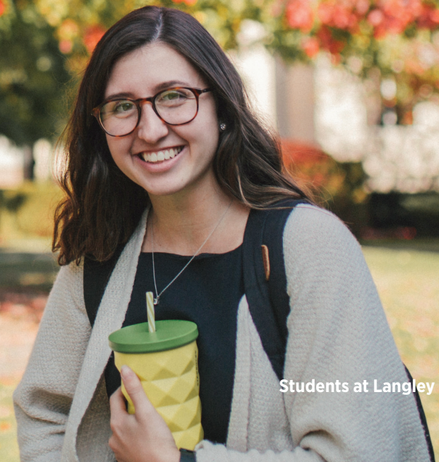
Students at Langley Campus